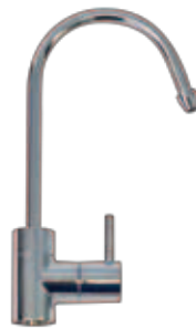
Dedicated faucet for RO water.