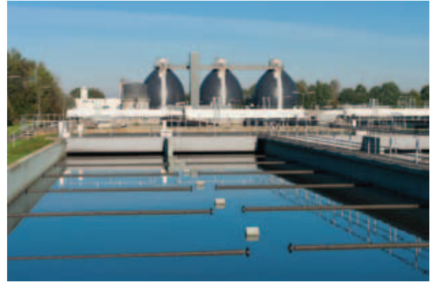
When water leaves a municipal water treatment facility, it meets all the guidelines of the Safe Drinking Water Act. But, the water coming out of your faucet may not.