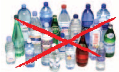
Better For The Environment