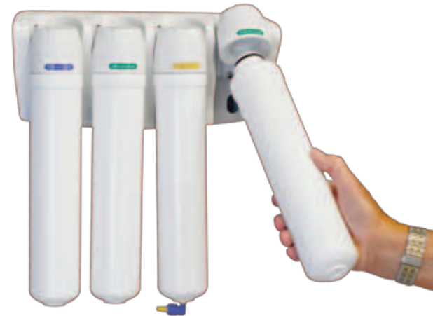
Wall Mount Model SWQCRO-WM-50