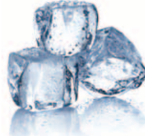
Better Ice Cubes